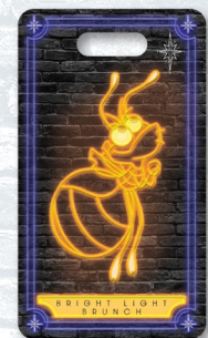
Bright Light Brunch Entry Tag

Event packages and add-ons are limited in availability. No discounts will be offered in conjunction with these packages and add-ons. All elements of the event are subject to change, postponement and/or cancellation without notice or liability. There are no cancellations or refunds, and event packages and add-ons are non-transferable. Disney reserves the right to take photos or videos during the event, and use those photos and videos for marketing purposes. No items included with an event package or add-on may be sold, traded or redeemed for cash, and all items (and portions thereof) are non-refundable, non-transferable and will be forfeited if not used in conjunction with the 2024 Disney After Dark Pin Event . Individuals eligible for merchandise discounts at Walt Disney World® Resort may receive their standard theme park merchandise discount on merchandise purchased via the RSP or at the event. Additional seasonal, promotional, or other discounts or offers will not apply. Other restrictions apply.