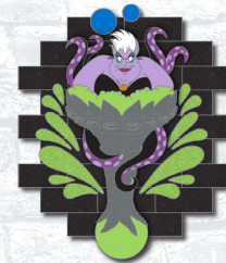
Starlight Package Gift 2-Pin Set